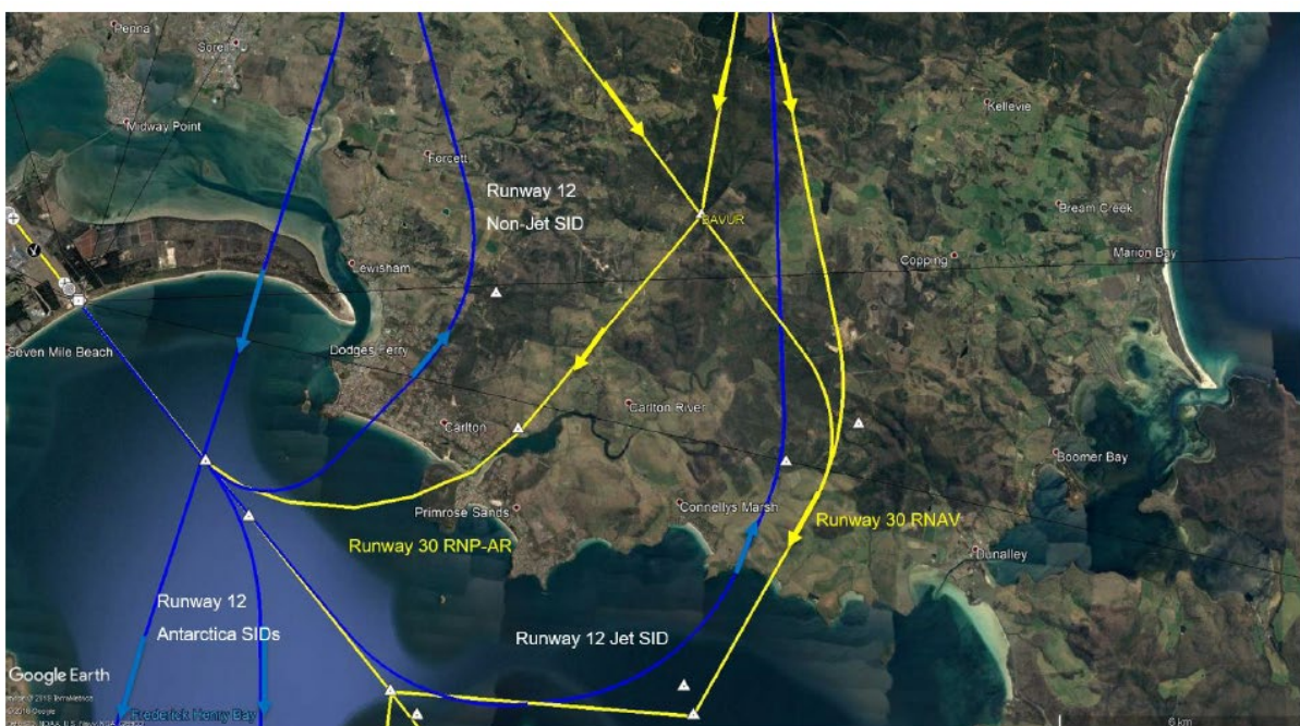
Figure 3 - Final Design (March 2019) - Zoomed in image showing Runway 12 departures and Runway 30 arrivals in the South East region; arrivals (yellow); departures (blue); waypoints (white triangles), from Airservices' Hobart-Airspace-Design-Review-Final-Report-March-2019, Figure 4, page 23.